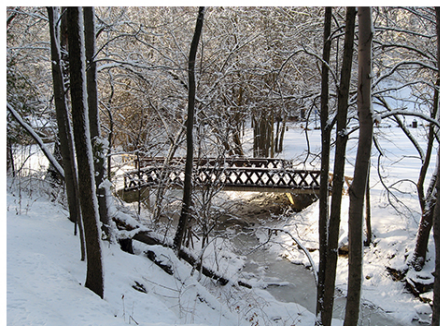
Happy Hollow Park

Wishing you a Happy Holiday season and a joyful New Year.