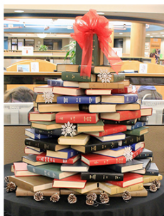
HSSE Library Book Tree