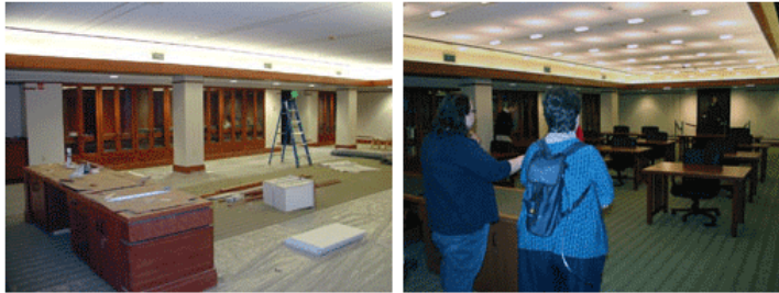
Above: Lawrence E. and Janet Hiler Reading Room, before and after.

Libraries staff were provided with guided tours on December 15, 2008 of the new Virginia Kelly Karnes Archives and Special Collections Research Center.