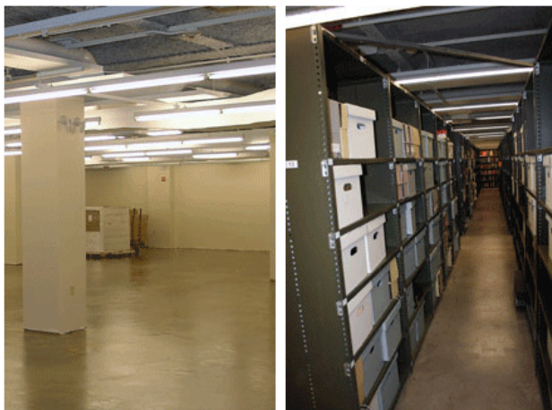
Above: Shelving for collections, before and after.

The new Archives & Special Collections space will be open to the public when classes commence on January 12, 2009. Grand opening events are being planned for April 2009 to coincide with Purdue's Gala Week.