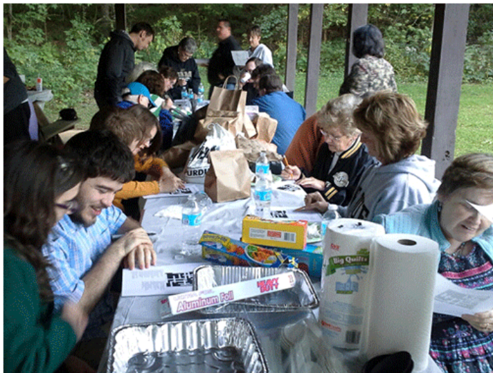
Photo: Last year's attendees are working the crossword puzzle.

https://purdue.qualtrics.com/SE/?SID=SV_0dOLVfph3nOCbYx