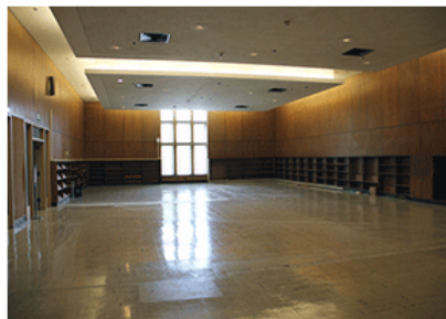
The Libraries Reading Room, 1913 and the former Data and Metadata and Digitization office space, 2014.