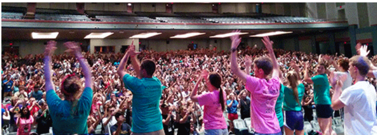
3000 students dancing in Elliott before the Libraries' presentation.